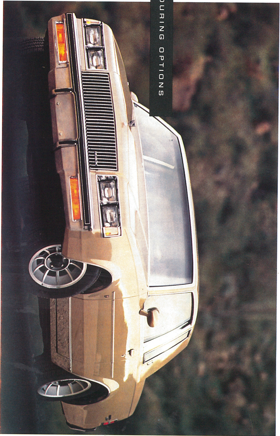
Regal Limited with 'T' Package

The Buick Regal is a car with a lot of get-up-and-go. For those who have a real preference for the characteristics associated with performance suspensions and handling, here's how to give the Buick Regal even more get-up-and-go. Order the 'T' Package, which includes the following: