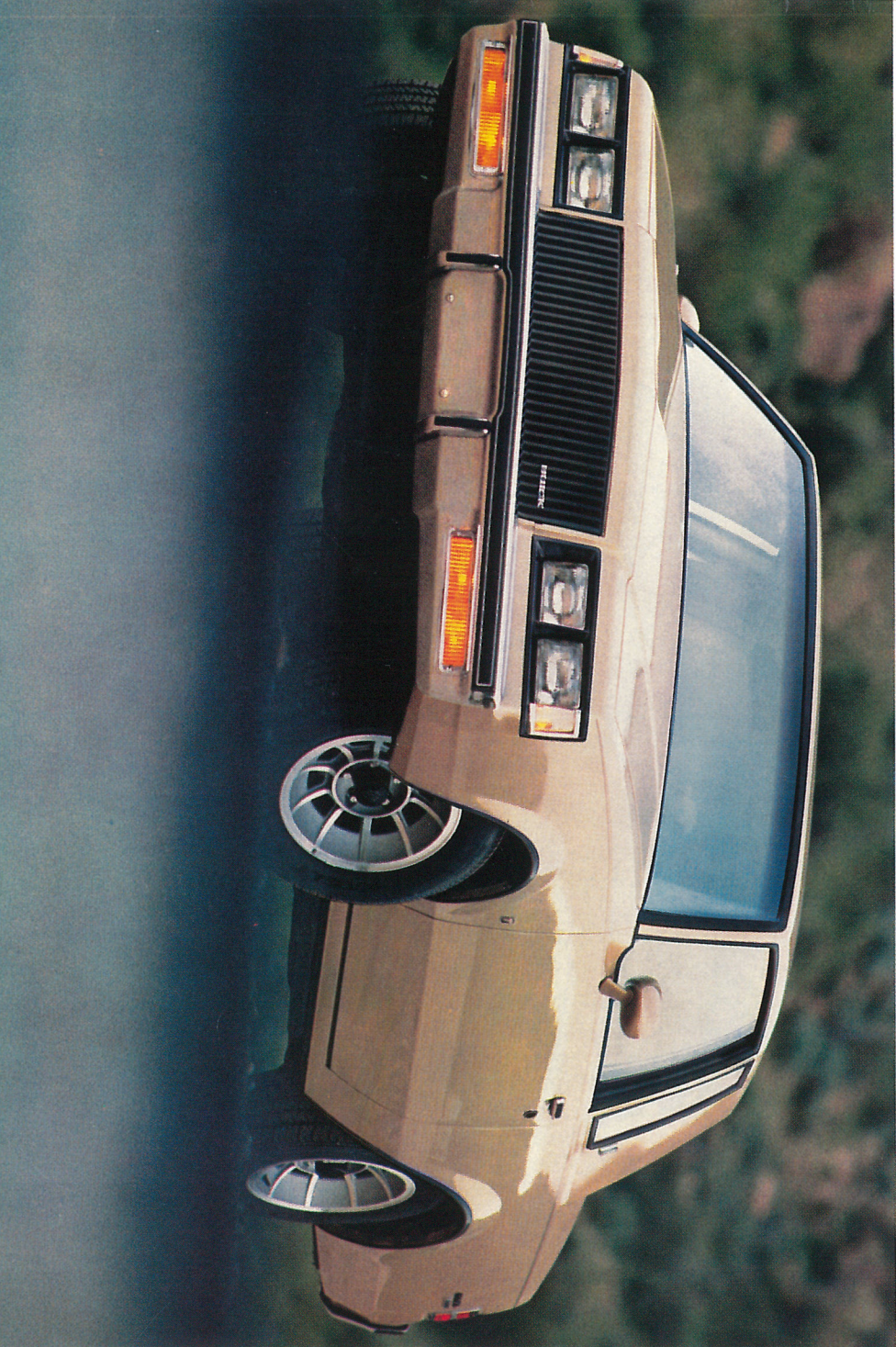
Regal Grand National